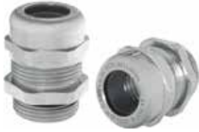
SKINTOP® MS-M ATEX