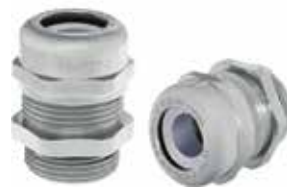
SKINTOP® MSR-M ATEX